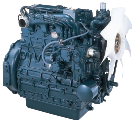
Photograph may show non-standard equipment.