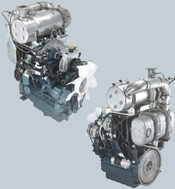
Photographs may show non-standard equipment.